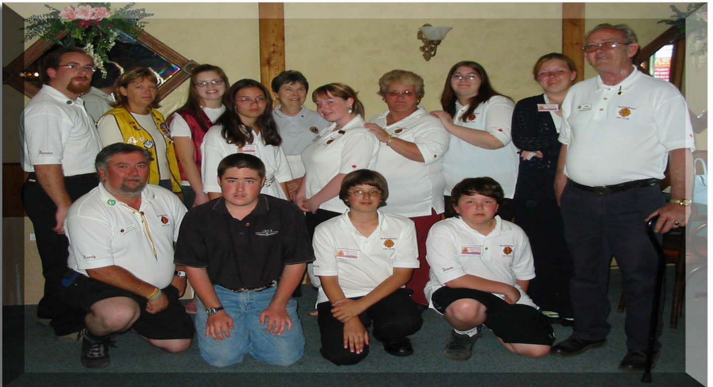
Gravenhurst Leo Club Charter Night June 7 2006

And anyone else out there who I was not told about our thoughts and prayers go out to you and your family.